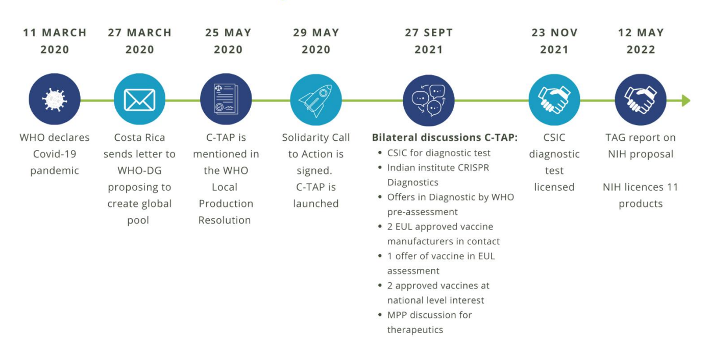
Figure 3: Timeline of C-TAP's key moments:<sup>15</sup>

The following section provides an overview of the evolution and timeline of C-TAP from its inception to the present.